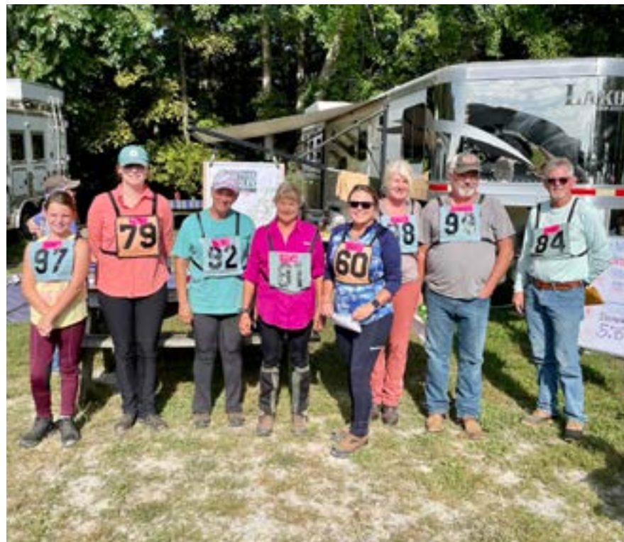
Welcome to Region 5! First time riders @ Ride the Edge.

I did not get a chance to consume, but I absolutely loved the thought of having a food truck out there!!! The trails were marked beautifully!! Everyone was so very helpful. The camp host was very helpful. I cannot be any more pleased. I don't have any recommendations and as usual... when I needed the Safety Riders.. they were right there! So Much FUN!!!