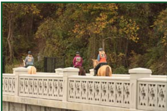
Riders at Biltmore Estate, Asheville, NC